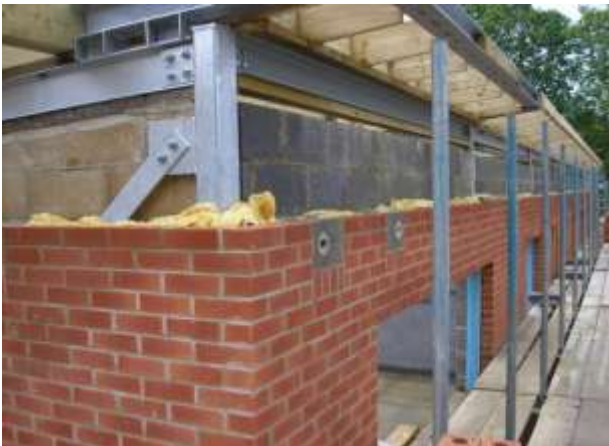
New Barnet, North London: Schwegler "Swift Bricks" installed in a sheltered housing project

Don't allow creepers or plants to encroach on the nest. They will hinder the Swifts and give access to predators.