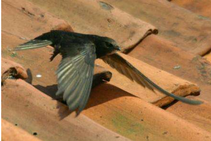
A Swift leaves its nest under pantiles near Lincoln: © Bill Ball