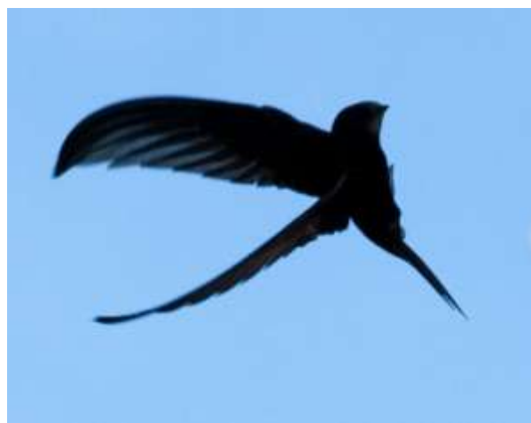
A Swift comes in to land in its nest